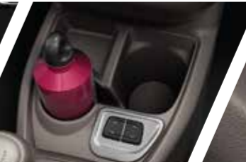
CUP HOLDERS Two cup holders upfront provide a secure place to keep your drinks closeby.