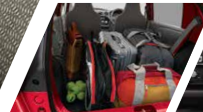
BOOT SPACE The Datsun redi-Go provides a generous boot space, of 222 l. When you need to bring larger items, simply fold down the rear seats and you've got over double the available space. Perfect for luggage, cricket equipment, or other bulky items.