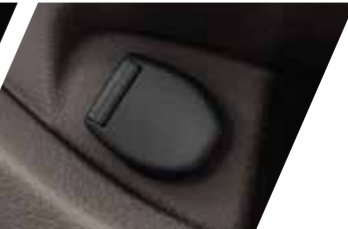
12V OUTLET Need to charge on the go? The redi-GO comes with a standard 12V outlet that allows you to plug in a charger or other compatible electronic devices.