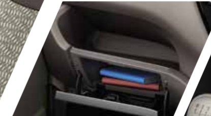
GLOVE COMPARTMENT Keep your belongings out of sight and within reach.

If there's one thing that strikes you about the bright interiors of the Datsun redi-Go, it's the amount of thought that has gone into designing spaces within it. From the glove compartment to the easy fold down rear seats, everything is designed to maximise storage, space and convenience.