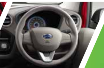
SPEED SENSITIVE ELECTRIC POWER STEERING Take control of your drive. A responsive power steering system provides the capability you need, to easily turn at lower speeds, along with firm handling at higher speeds.