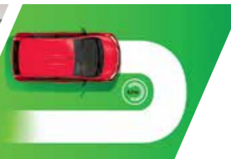
SMALL TURNING RADIUS The compact design of the Datsun redi-Go provides the ultimate manoeuvrability. Make a full turn-around with just a 4.7 m turning radius. Handy, for when you find yourself in a tight spot.